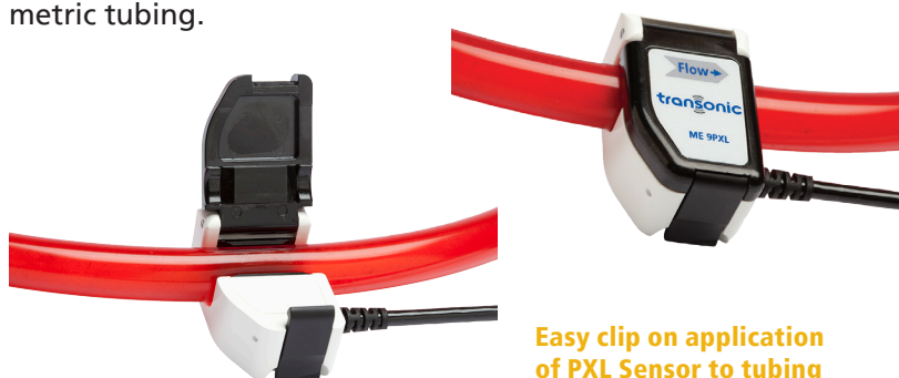
Easy clip on application of PXL Sensor to tubing

Transonic® PXL Clamp-on Tubing Flowsensors clip on the outside of flexible laboratory tubing. No physical contact is made with the fluid media. A thin smear of Vaseline® or petroleum jelly should be applied to the section of tubing where the Sensor is applied to provide a good seal between the transducers and the tube for best ultrasonic signal transmission. PXL-Series Flowsensors can be factory calibrated and programmed for up to 4 different fluid, temperature, tubing, and flow rate combinations. Sensor size is determined by the outside diameter of the tubing. Standard PXL Sensors are sized in 1/16" increments. Metric sizes are available for metric tubing.