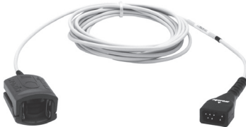
MLT321 SpO 2 Finger Clip Transducer

Finger Clip or Ear Clip transducers connect directly to the 9-pin socket on the rear of the Oximeter Pod.