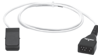
MLT322 SpO 2 Ear Clip Transducer