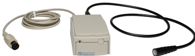
ML330 Light Meter with the MLT331 Light Meter Probe Attached